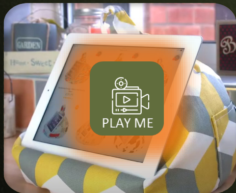
Promo example 4