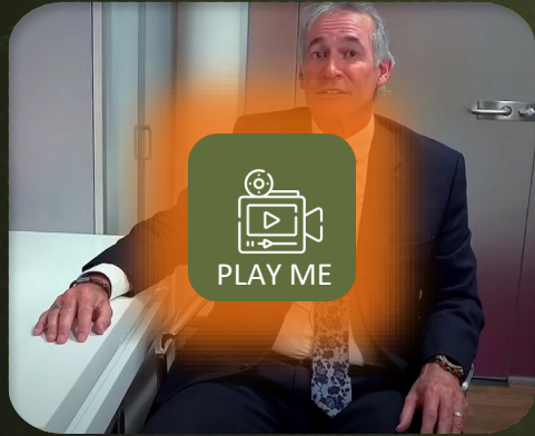
Corporate Motion Show Reel

Here you'll find a small collection of promotional films showcasing my work created for clients.