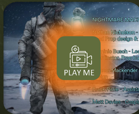
Promo example 6