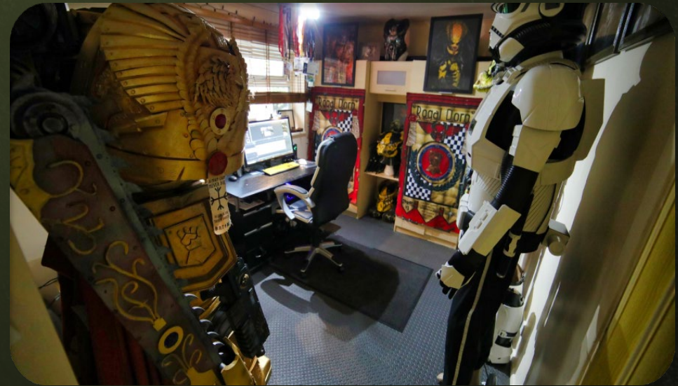
(Where the creative work gets done)