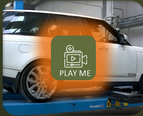
Promo example 1