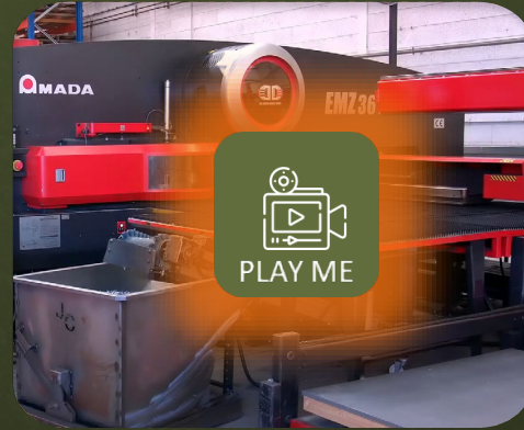
Promo example 2