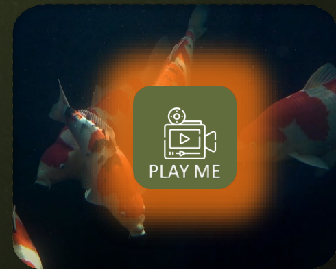
Promo example 7