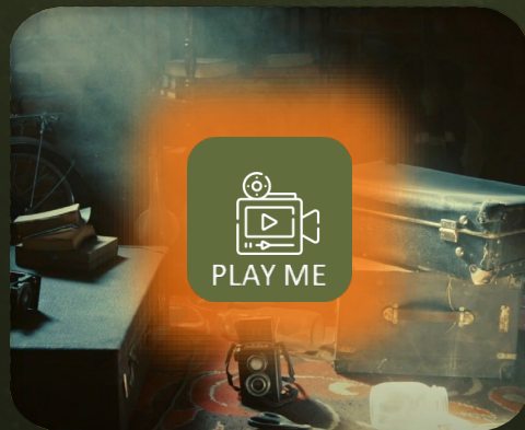
Promo example 5